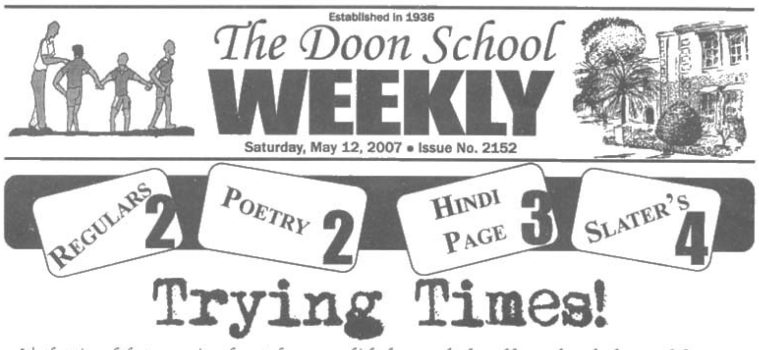
It's that time of the term again, when students carry thick, dusty textbooks and battered notebooks around the campus looking as if they were actually imbibing some knowledge (perhaps through osmosis) from them. We do, however, see some boys enjoying Trials as they give up the struggle and loaf around the tuck shop. We also see others who have already memorised their course-work three times over and are reciting whole chapters to themselves. And then, there is the third category that has not made significant inroads into the syllabus to be covered, but who still refuse to give up. Their books remain open right till the last few seconds before the Trial and by the end of it, they still haven't progressed much. The Doon School Weekly presents a cross-section of opinion regarding the dreaded 'T' time